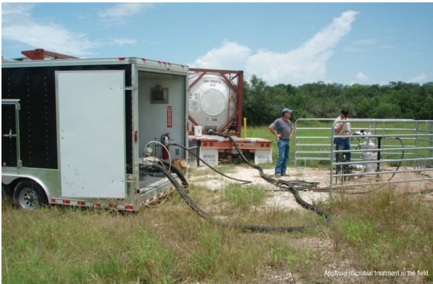
Applying microbial treatment in the field.